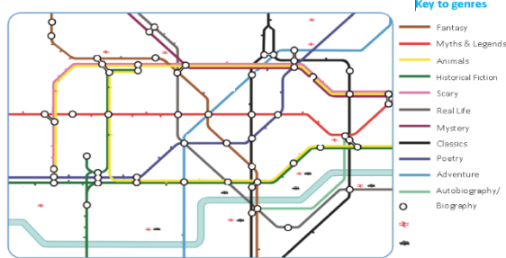
London Underground Map

The librarians have been very busy keeping our library tidy. They ensure the smooth day-to-day running of our library by organising books into their genres and preparing it for class visits. Book recommendations will be on display so please encourage your children to look out for these and to continue reading books across a range of genres. Children can tick off their genres on their tube maps in the back of their reading logs.